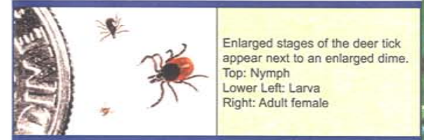
Enlarged stages of the deer tick appear next to an enlarged dime. Top: Nymph Lower Left: Larva Right: Adult female

Deer ticks search for a host at ground level. Ticks acquire the disease agents from the white-footed mouse and other small mammals.